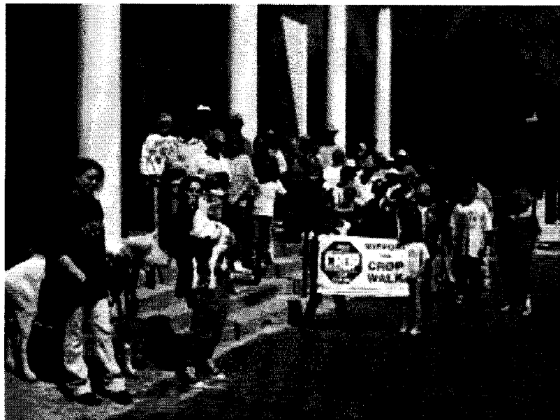
Volunteers from area churches participated in a May 6 CROP walk that raised funds for local hunger fighting agencies. For more information on CROP events, contact Fred Hubley at 938-5521

To cover the cost of postage increase, the new subscription price has to be increased to $18 per year. We regret the inconvenience.